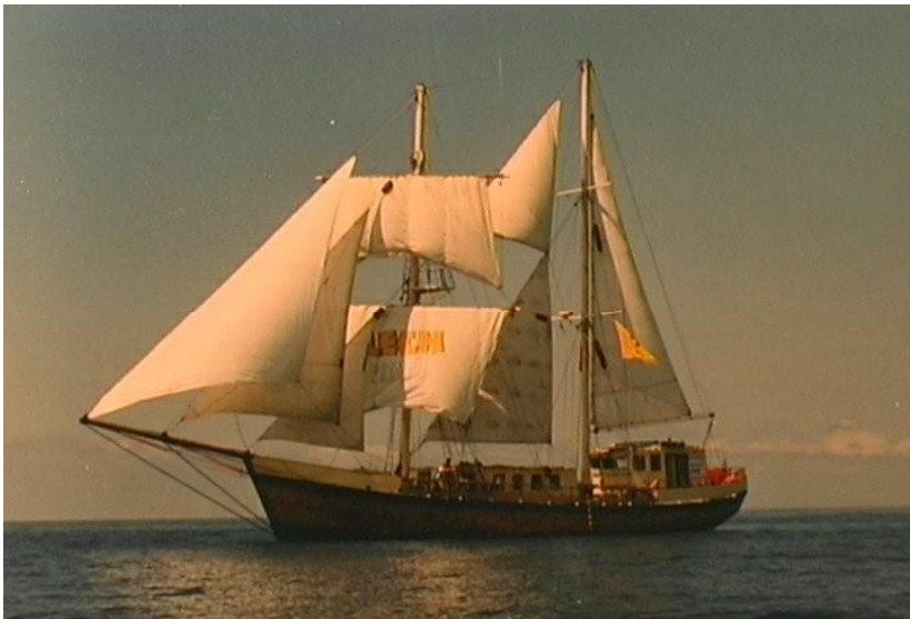
32 m LOA Kapitan Głowacki (COŻ)( polish flag)