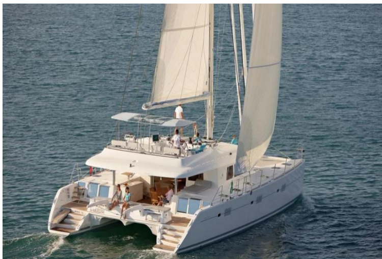
20,5 m LOA s/y Hi Ocean One ( company) ( PL flag )