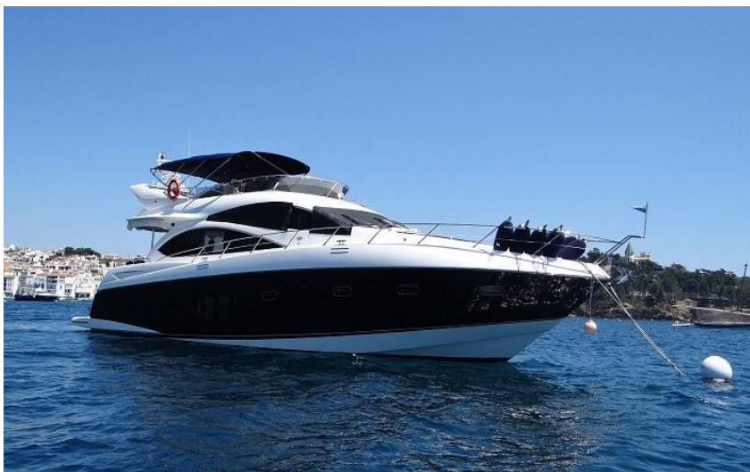
2,5m LOA m/y Syrena ( Azimut 68) ( priv.) (US flag )