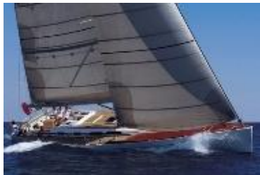
Grand Soleil 54

on many chartered yachts, monohulls and catamarans, sailing and motorboats on Pacific, Caribbean Sea, Seychelles, Bermuda Triangle, Bahamas, Mediterranean, Atlantic, Canary Islands, Cabo Verde, Senegal, Gambia, U.S.A. East Coast North Sea, Red Sea, Indian Ocean, Black Sea and Baltic, Zanzibar, Tanzania.