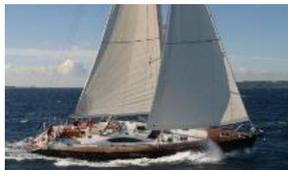
Sun Odyssey 54 DS

Visited seas : Pacific, Caribbean Sea, Bermuda Triangle, Mediterranean, Atlantic, U.S.A. East Coast, North Sea, Red Sea, Indian Ocean, Black Sea, Baltic