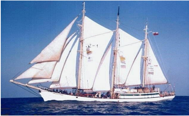
44,2 m LOA ( priv. ) (GB flag )