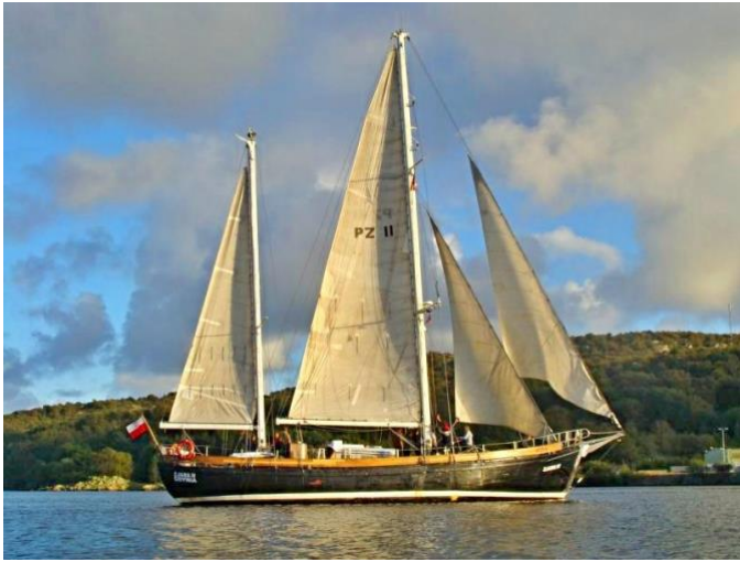
18,6 m s/y Blue Note ( priv.) ( US flag)