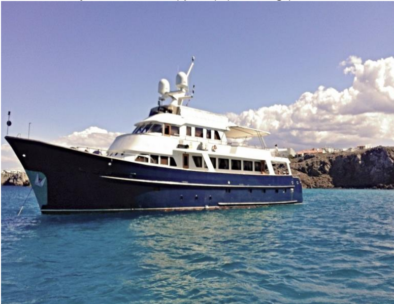
34 m LOA s/y Cap San Aragon ( priv. ) ( DE flag )