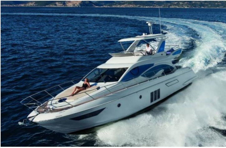
15,5 m LOA m/y Mediterranean Muse Rodman 50 ( company) (SP flag)