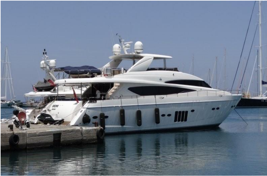
26 m LOA m/y Lia - A ( 2 x 1350 hp ) ( priv. ) ( GB flag )